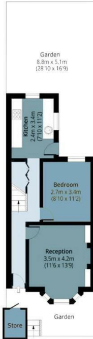
Lower Ground Floor Approx. 41.56 Sq. meters (447 Sq. feet)